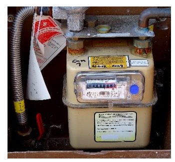
Gas Meter The Gas Supplier is responsible for the gas supplied through the meter and the maintenance of the meter.